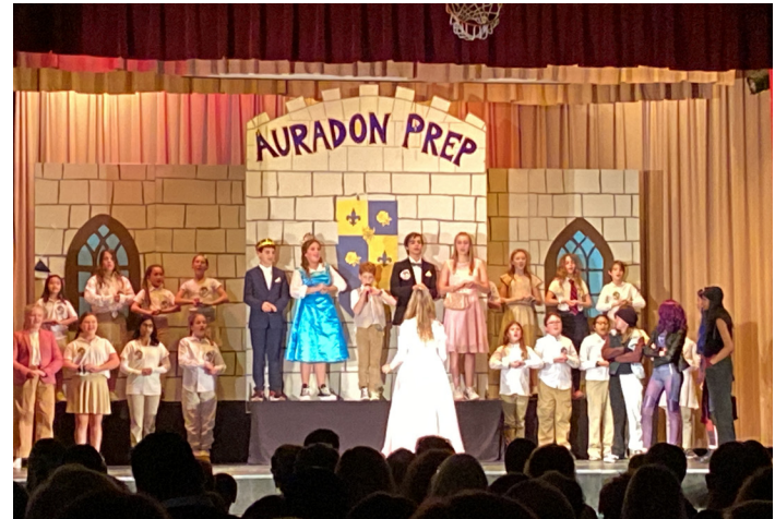
Middle school cast and crew worked hard to pull together a terrific showing of Disney’s Descendants.

These high ratings reflect the tremendous efforts of our students, staff and community, showing we are making great progress toward our strategic plan goal of engaging students’ academic curiosity.