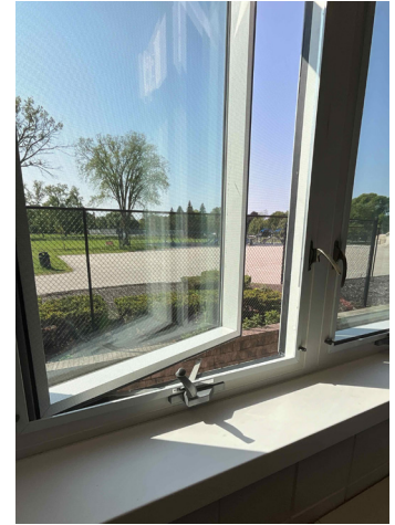
Completed window replacement