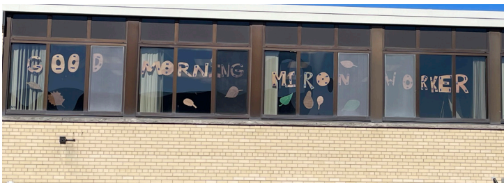
Students created a sign for the construction crews