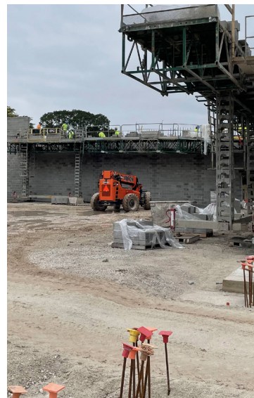
New gym masonry walls