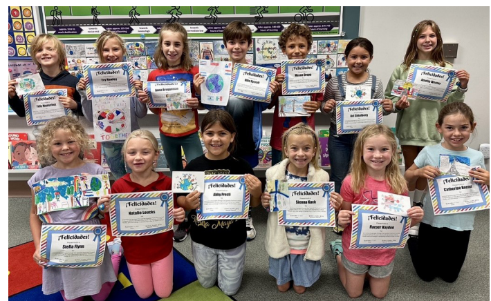
16 Stormonth Spanish students are advancing to the state contest for Wisconsin Languages.