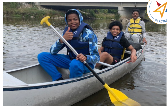
Eighth graders canoeing on the Milwaukee River with the Schlitz Audubon Nature Center.