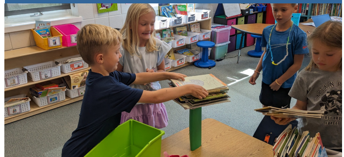
First graders participating in STEAM challenge.