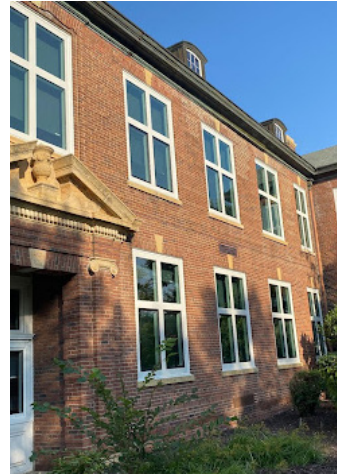
Stormonth received 230 new windows

Interior renovations and upgrades to finishes will begin next spring. In summer 2024, Stormonth will be closed for major upgrades, including the replacement of the building's original heating, ventilation and air conditioning (HVAC) and electrical systems, interior finishes, exterior door replacement and the addition of a fire suppression sprinkler system.