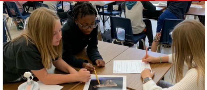
Sixth graders thinking like archeologists in social studies.