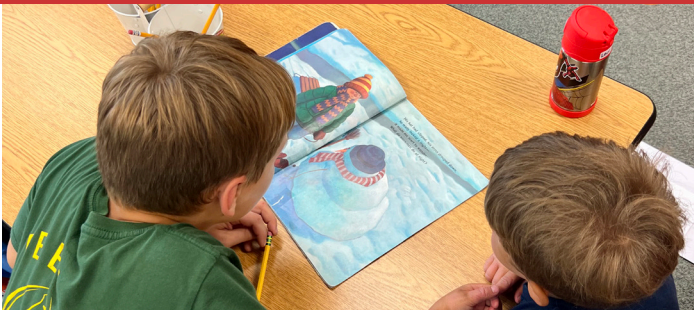
K5 and fourth grade buddies reading together.