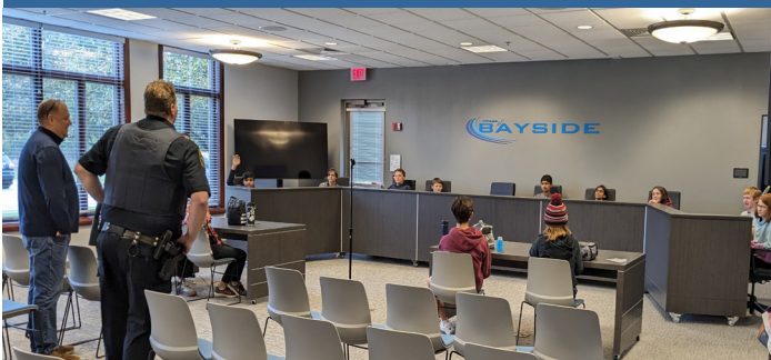
Eighth graders learning about government at Bayside Village Hall.